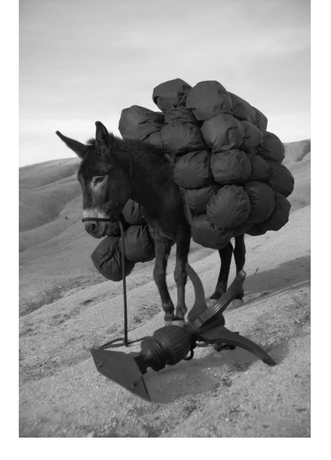
brave new world (ii) 2017 Pigment print on hahnemuhle paper 130 x 87cm (unframed) Edition of 6 + 2AP $3,500 unframed / $4,500 framed